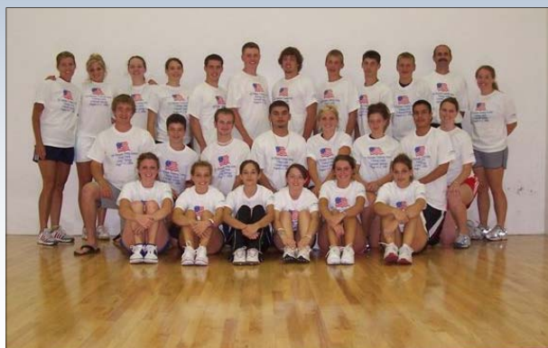
2006 USA Junior National Team

Congratulations to Team Mexico for a hard-fought, well-deserved victory!